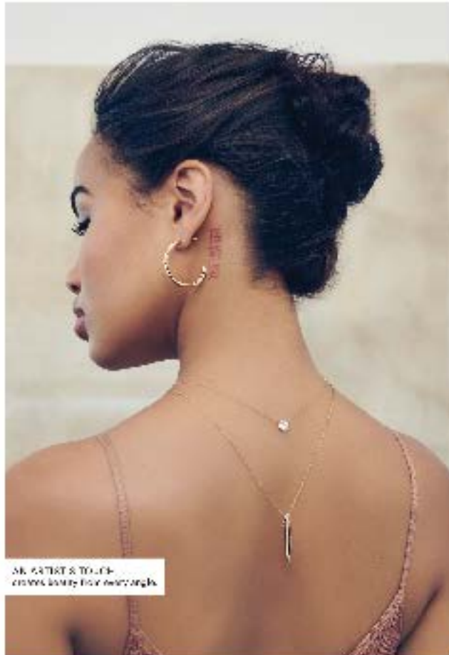
AN ARTIST'S TOUCH— creates beauty from every angle.

The Tacori collection—and her always laser-focused attention to detail—do you see diamonds everywhere? So do we. We take inspiration from our surroundings, our family. We love to view precious stones in nature, in bed rocks, and in the most serene of places. What we do is take what we see and make it in what we design or how we wear it, there's a balance. There's a story that's inspired by design, and we're to be inspiring and progressively leading forward.