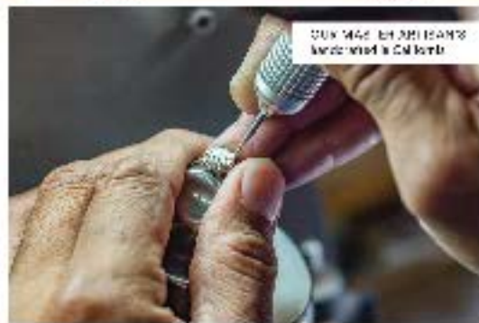
OUR MAESTROS handcraft a truly Tacori.