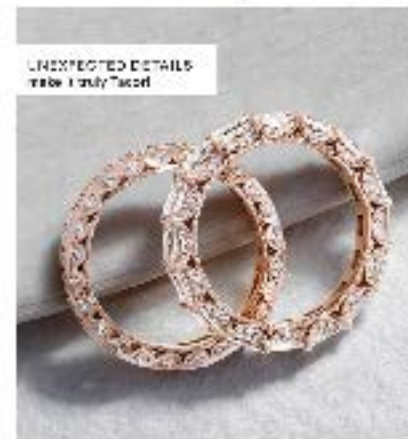
UNEXPECTED DETAILS take a truly Tacori.