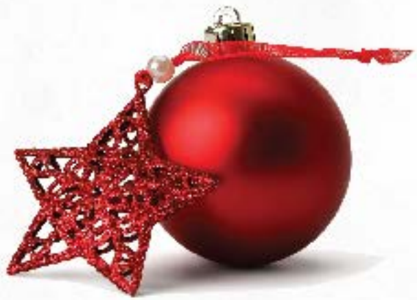
A. EYP-10622 $345 B. CZS-10414 $262 C. CZE-10903 $464 D. BZY-10466 $247