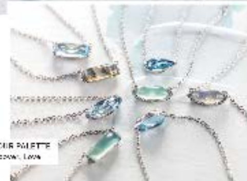
CHOOSE YOUR PALETTE Collect, Gleam, Love.

Tacori design is inspired with artistic intent to create a legacy of love. Each piece is crafted by design, and brought to life by master craftsmen. When you see the amount of care and attention to one small stone, you understand how something so small, can mean so much. When you own it, you know the only Tacori.