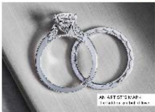
AN ARTIST'S TOUCH— creates beauty from every angle.